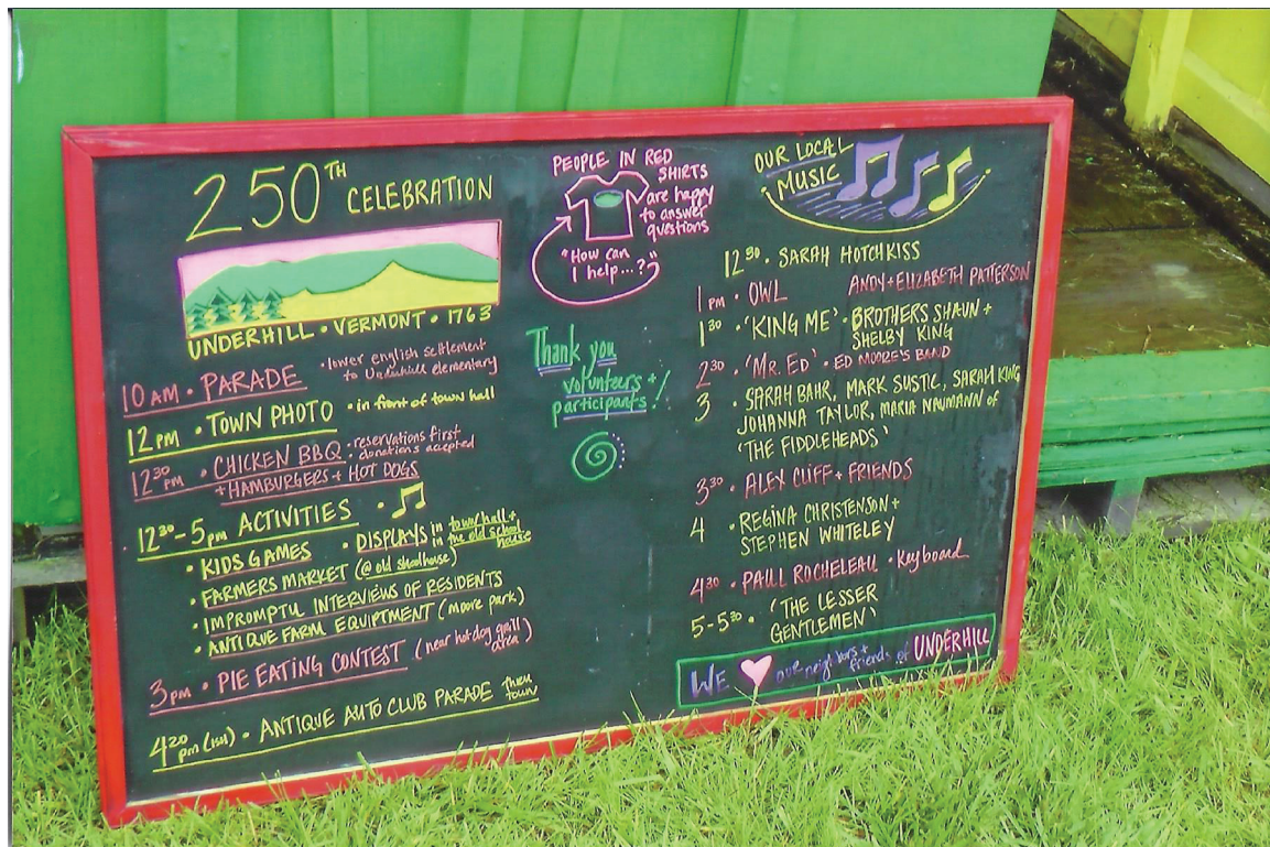
Colorful chalk art 250th celebration day agenda by Abbi Jaffe