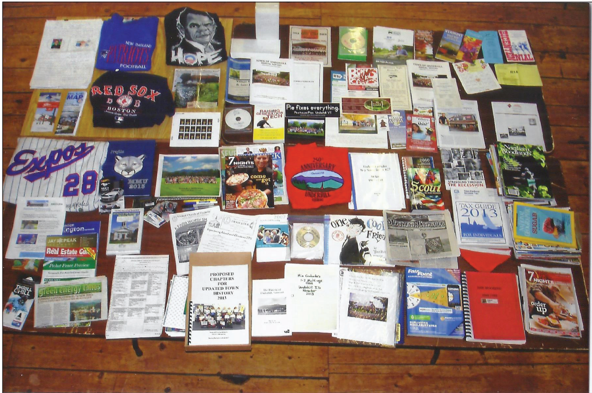
Time Capsule Contents