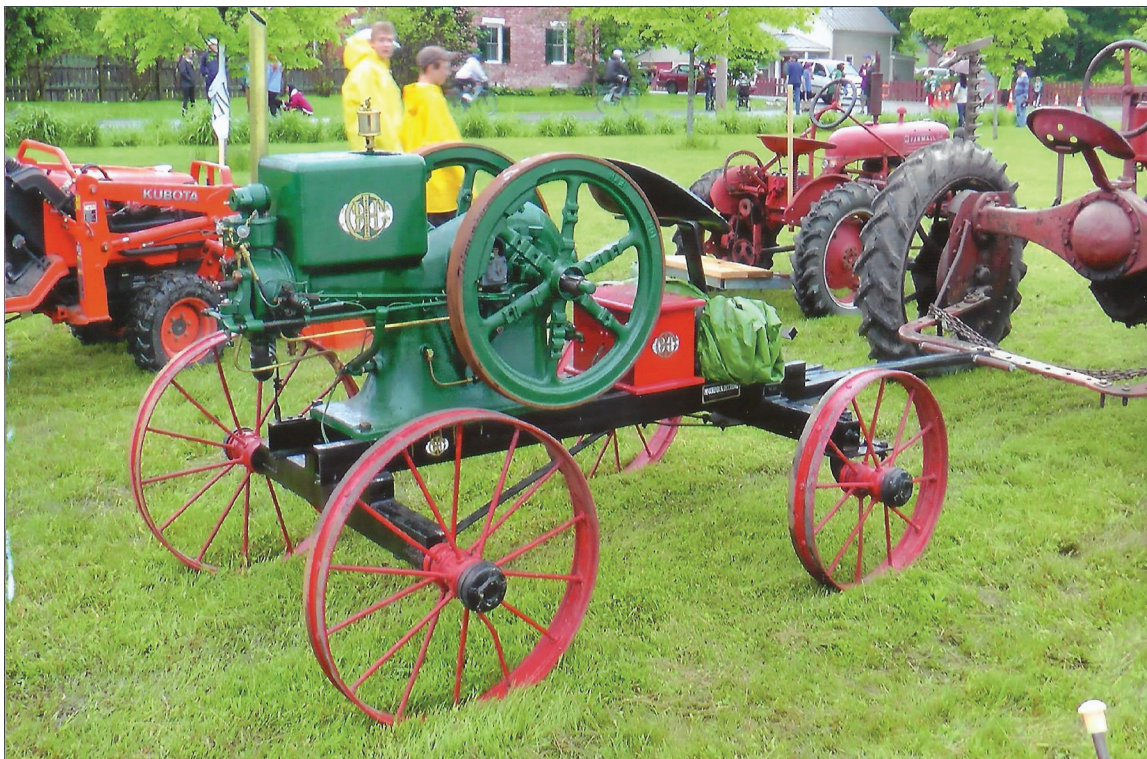
Beautifully restored 'one lunger' single cylinder gas engine on display amongst other antique farm equipment.